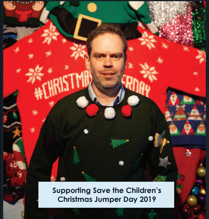
Supporting Save the Children's Christmas Jumper Day 2019